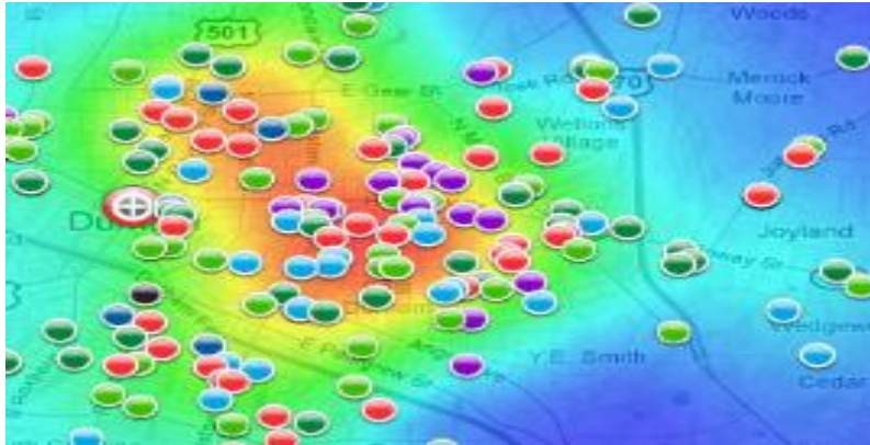
Figure 3 : Crime Spots

We analyzed that crimes vary with criminal's age and health or political power also. So, we need to analyze these things deeply. Though we didn't find any distribution between crime hotspot and people race connection.